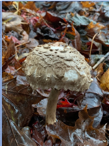
Shaggy Mane mushroom