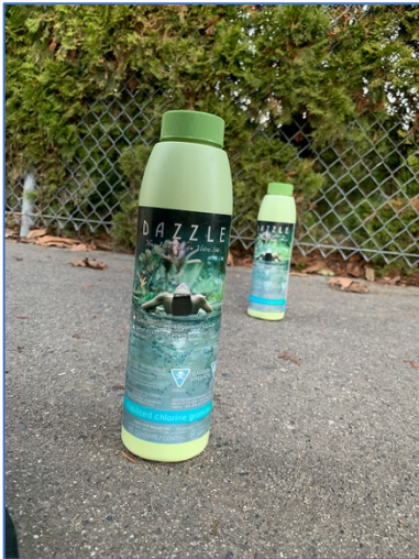
Hot tub chemicals